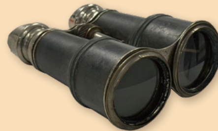
▲ 東江縱隊隊員使用過的望遠鏡 Binoculars used by member of the Dongjiang Column

Telegraph announcing Tsang Sang as Commander and Wang Zuoyao as Deputy Commander of the Dongjiang Column, 1 January 1944