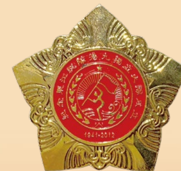
◀ 東江縱隊港九獨立大隊成立70周年紀念章 Commemorative Badge for the 70th Anniversary of the Establishment of the Hong Kong Independent Battalion of the Dongjiang Column

1931年九一八事變後，中國人民就在白山黑水間奮起抵抗日本軍國主義侵略者。1937年七七事變後，中國進入全民族抗戰階段，並開闢了世界反法西斯戰爭的東方主戰場。